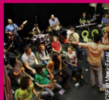
CSF at MusicFest