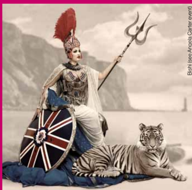
Bish! (see Angela Carter event)