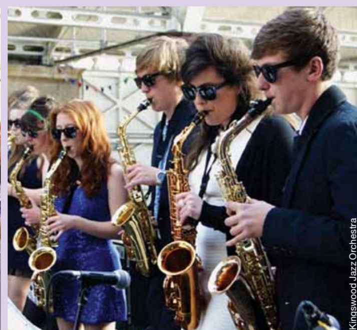
Kingswood Jazz Orchestra