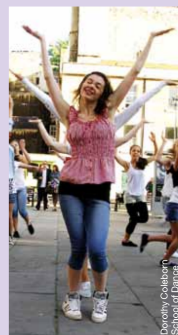
Dorothy Coleborn School of Dance