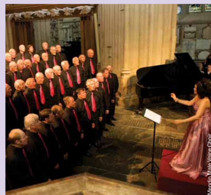
Mendip Mitea Voice Choir